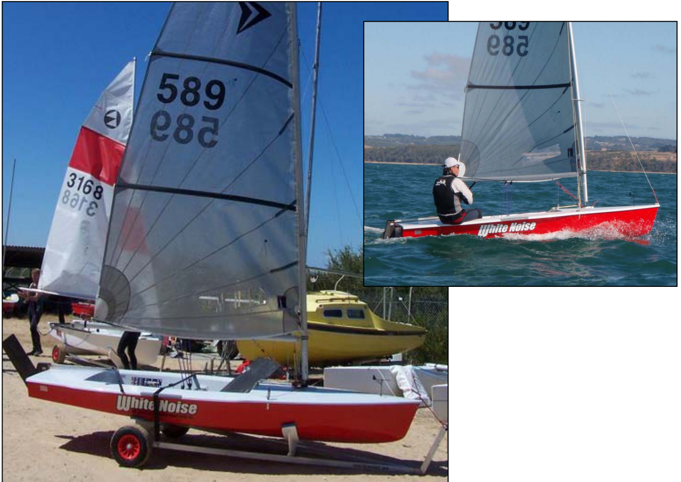
Race C Model White Noise 589 on standard alloy trolley

Coloured floor non-slip polyurethane additional $50.00