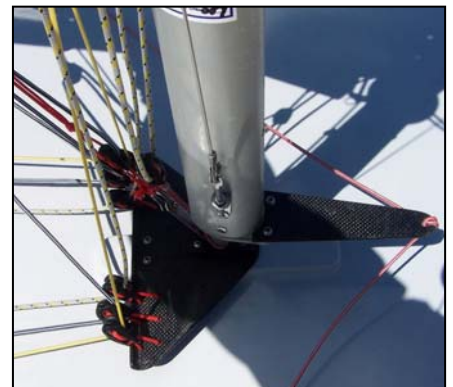
Carbon mast triangle and mast spanner