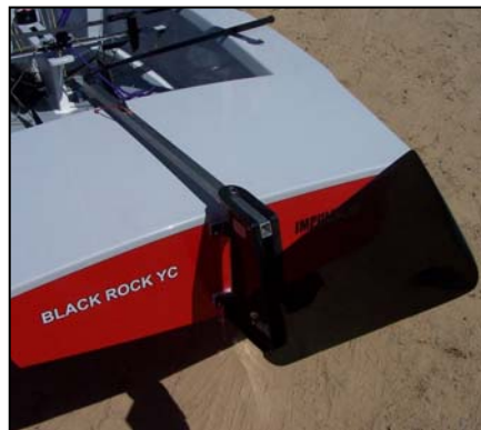
Moulded carbon rudder box with cedar/carbon blade